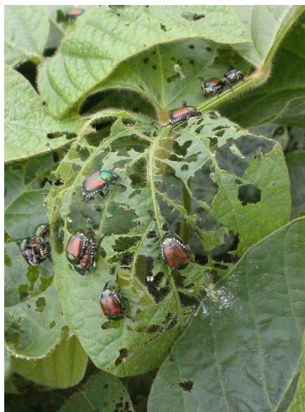
Fig. 2. Japanese beetles ( Popillia japonica ) consuming soybean leaves. The Japanese beetle is a broadly polyphagous species introduced into the United States in 1916 that is now expanding its range throughout the Midwest (27). Japanese beetles are attracted to poorly defended, high-sugar soybean leaves that develop under elevated CO 2 . Future increases in CO 2 and temperature may further the success of such destructive invasive species (28)

A rise in CO 2 generally increases the carbon-to-nitrogen ratio of plant tissues (17, 18), reducing the nutritional quality for protein-limited insects (19). Insects may accelerate their food intake to compensate for reduced leaf nitrogen content (19–21), although this is not always the case (22, 23). By exposing a soybean crop to elevated CO 2 under